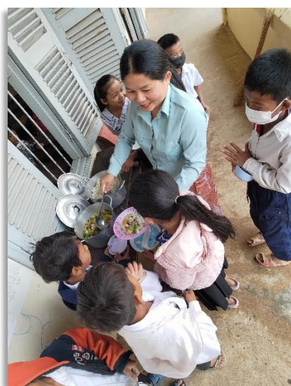
Kouk Mon Primary School